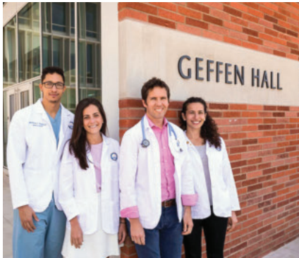
From Top: Students at the UCLA Samueli School of Engineering.